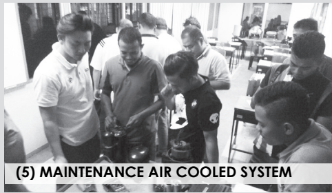
(5) MAINTENANCE AIR COOLED SYSTEM