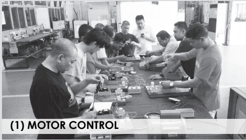
(1) MOTOR CONTROL

ILPKL is now established for its customized courses that are being held during weekday and also weekend for the trainers. Lately there have been short courses conducted by the RAC, Electrical and Automotive Department which was schedule from the 6th February till 28th February 2017 at their own workshops.