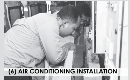
(6) AIR CONDITIONING INSTALLATION