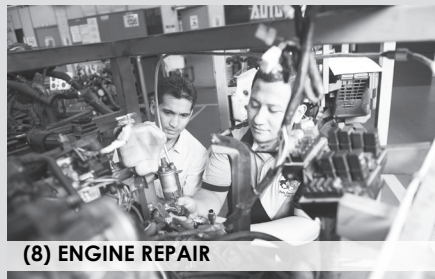
(8) ENGINE REPAIR