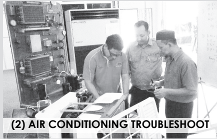
(2) AIR CONDITIONING TROUBLESHOOT