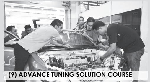
(9) ADVANCE TUNING SOLUTION COURSE